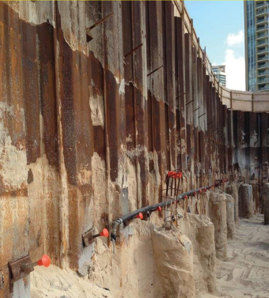
Above: Redevelopment site excavation with anchored sheet piling and exposed piles from earlier construction.