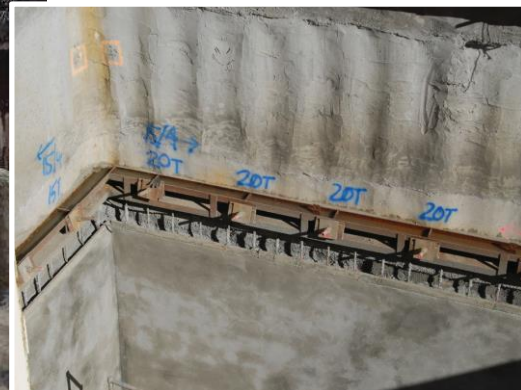
Above: Anchored CFA wall.