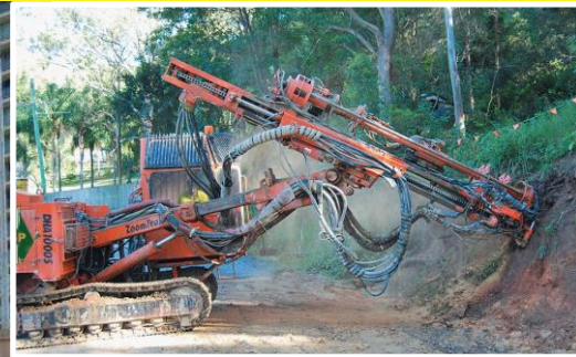
Above: Anchoring a roadside batter for stabilisation.