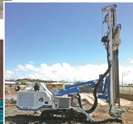
Above: ASP Soilmec anchoring rig.