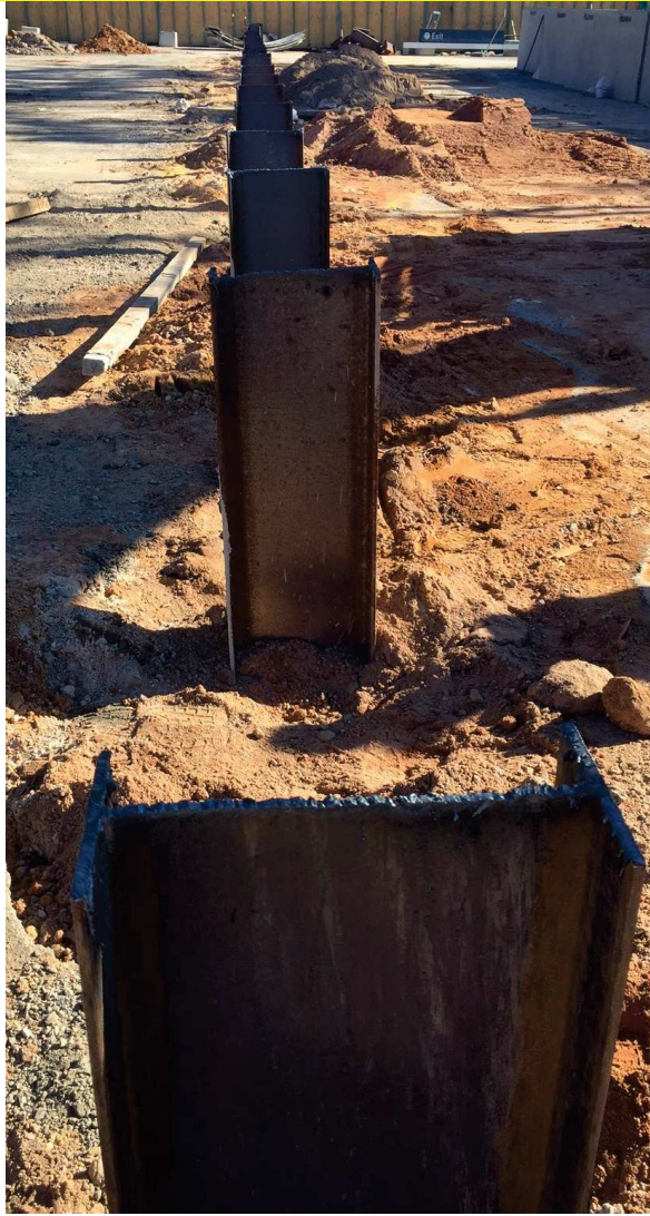
Above: Bored piers can be constructed using steel as well as grout.