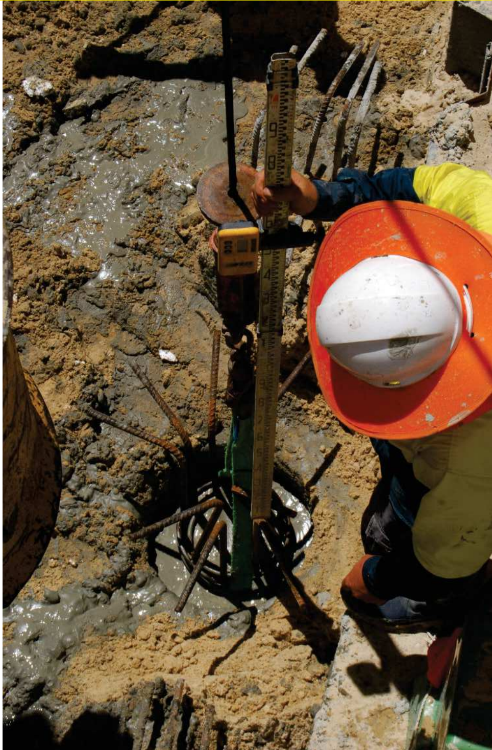
Below: Installation at a school site.